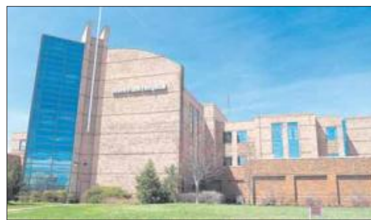
RIVER PARK HOSPITAL