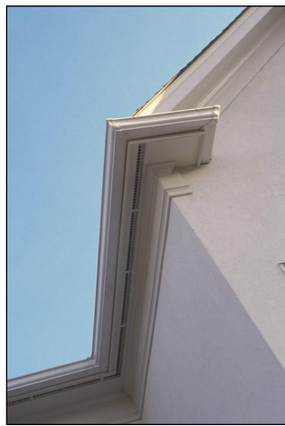
Passive and active venting systems for attics help keep homes comfortable and energy-efficient all year long.

Attic ventilation is a system of air intake and exhaust that creates a flow of air through the attic. In the summertime, air flowing through the attic will cool temperatures within the attic, preventing damage to the underside of roofing shingles and preventing ambient heat from traveling inside of a home. In the winter, air flow helps to keep the attic cool and dry. This prevents moisture that can lead to mold and rot issues from building up inside of the attic. Attic ventilation also prevents warm indoor temperatures and rising heat from warming up roofs during the winter, creating the freeze-thaw pattern that results in ice dams.