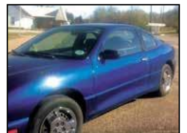
The photos with this article are of before and after...the damage to my Pontiac, and the wonderful repairs.