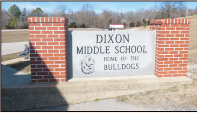
Sign at DMS Track. Pilot photo

The Dixon Elementary School promotes family and school communication by hosting a grade level “Family Night” each month.