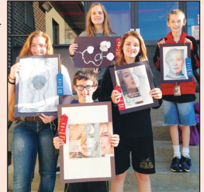
DMS Frisco Art winners. Submitted