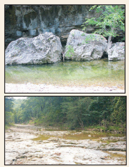
Clifty Creek.

Until just a few years ago, however, reaching this geologic wonder was no easy feat. Though it was the first place in the Show-Me State to be designated as a Missouri Natural Area nearly 40 years ago, no hiking trail existed to reach the dolomite arch. In fact, many visitors would wade the creek in hopes of find-