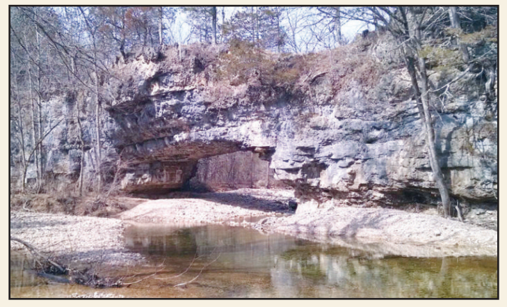
Clifty Creek natural bridge in winter.

The route begins at a parking lot on the adjacent Clifty Creek Conservation Area and travels across the forested, rugged terrain to the bridge, which spans a distance of 40 feet and is 13 feet high. Along the way, visitors can see stands of shortleaf pine -- Missouri's only native pine tree -- and interesting glade plants that are present