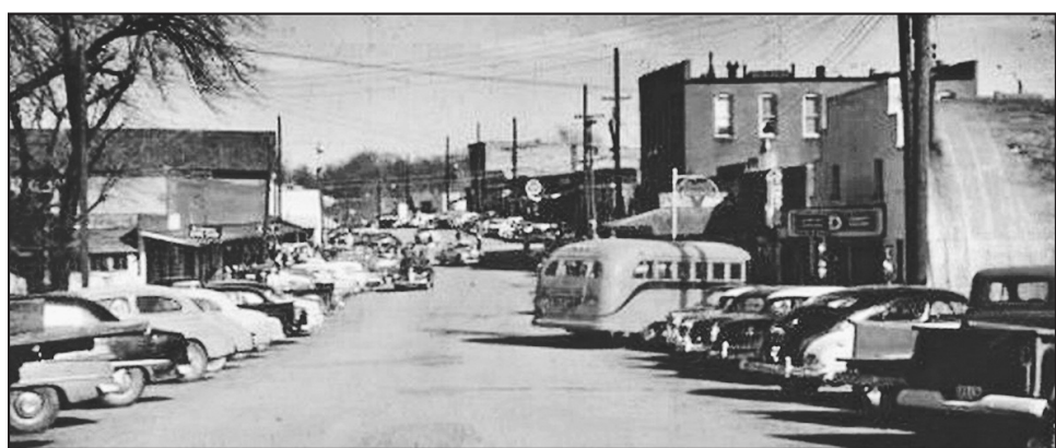
East View of Second Street in Dixon, MO c.1950's. The Dixon Theatre movie house is shown on the right in front of the school bus. This the building where Brandt's and Dixon Weather Service is located in 2016. Submitted by Donna Knapp

EAST VIEW OF SECOND STREET - A view of Dixon looking east on Second Street prior to the streets being paved; showing board sidewalks; the first telephone office and switchboard on the left in the building that looks like a banner on the front and later the Dakes' Café operated by Roscoe V. and Gussie (Null) Dake (parents of Gloria J. (Dake) Martin; numerous horses, wagons, and carriages prior to automobiles.