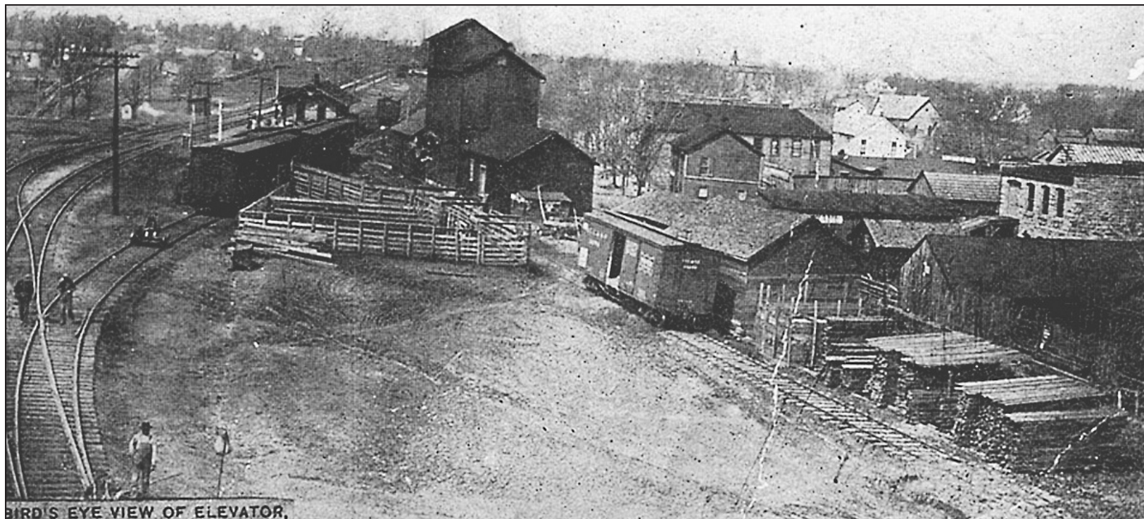
BIRD'S EYE VIEW OF ELEVATOR,

Bird's Eye View of Elevator, Dixon, MO previous to 1913. Submitted by Donna Knapp