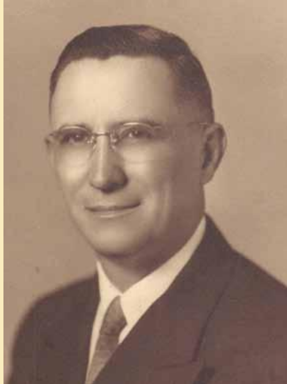
Kershaw's Oil Mill continued on page 2