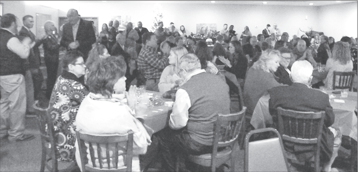
Guests at this year's Weakley County Chamber of Commerce Christmas Reception enjoyed good food, fellowship and door prizes – all provided by Chamber members from the City of Gleason.