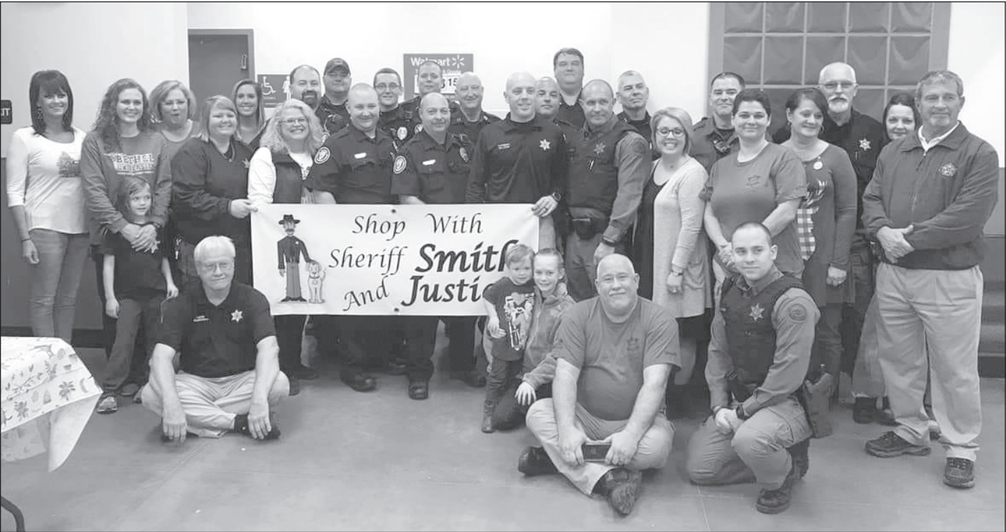
Weakley County law enforcement officer, court officials and DCS personnel joined together again this year to help raise funds to provide a Merry Christmas to 50 deserving youngsters.