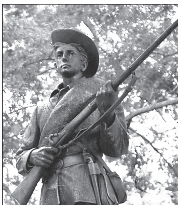
Silent Sam Statue on the campus of UNC Chapel Hill

Reactions to the proposal were swift. Activists and protesters called the proposed center a "shrine" to the Confederacy. Others argued the university