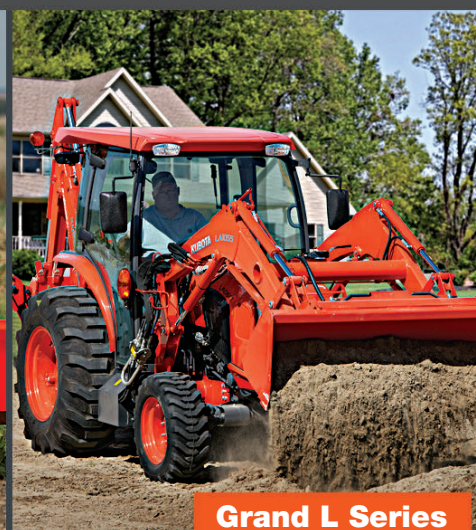
Grand L Series