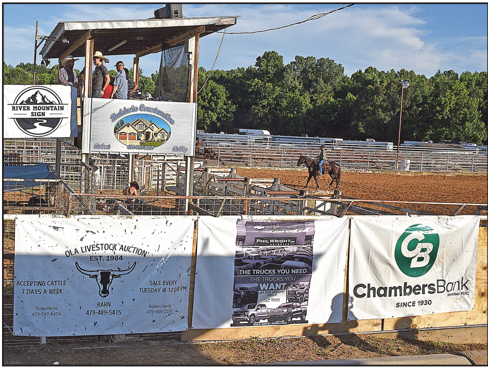
Chambers Bank always supports the Yell County Mounted Patrol and was a sponsor for the True Grit Mounted Patrol Rodeo.