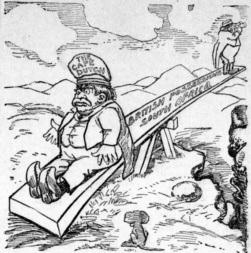
If the Cape Dutch should rise up, what would become of John Bull?—Minneapolis Tribune.