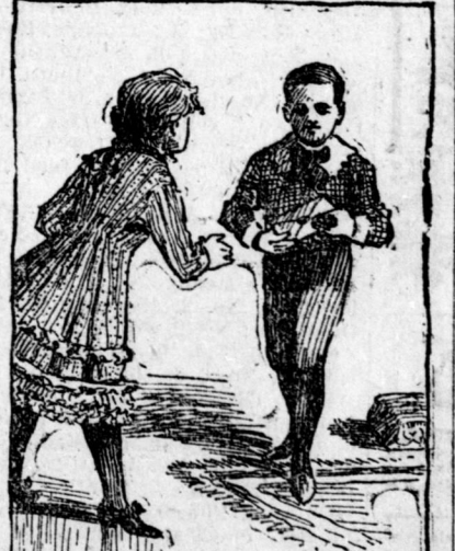
RELEGATED TO THE CHILDREN.