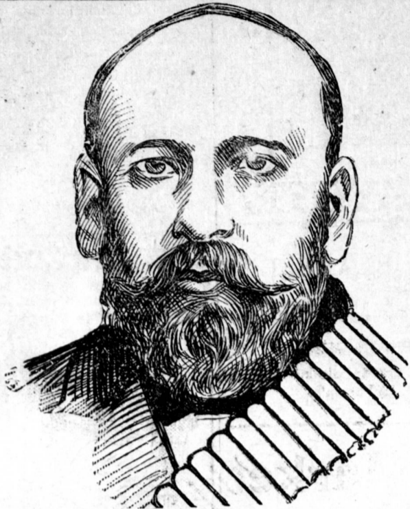
GENERAL CRONJE, WHO HELPED TO BLOCK BULLER. Next to General Joubert, commander in chief of the Boer forces, General Cronje has played the most important part in checking the efforts of the British to relieve Ladysmith. With Generals Pretorius and Botha, General Cronje commanded the forces that blocked Buller. These three Boer generals are all heroes of the war of 1881.