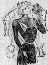
3040-LADIES' WAIST. Sizes 32, 34, 36, 38, 40.

Are you going to be in Fosston for the three days' celebration? If you are looking for a good time, come. If you come you will want to be well dressed. To get nobby clothes at a low price go to HUME'S STORE.