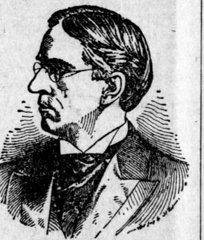
HON. CHARLES A. TOWNE.

Stevenson for Vice President. Kansas City, July 7.—The Democratic national ticket was completed yesterday by the nomination of Adlai E. Stevenson for vice president. The nomination was made on the first ballot, state after state joining in the wild scramble to record their support