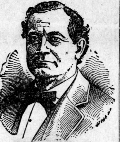
HON. WILLIAM J. BRYAN.

Bryan Unanimously Nominated. Kansas City, July 6.—William Jennings Bryan of Nebraska was last night placed in nomination for the presidency on the Democratic ticket on a platform opposing imperialism, militarism and trusts and a specific declaration for silver at the ratio of 16 to 1. The nomination came as the culmination of a frenzied demonstration in honor of the party leaders lasting twenty-seven minutes and giving utterance to all the pent up emotions of the vast multitude. It followed also