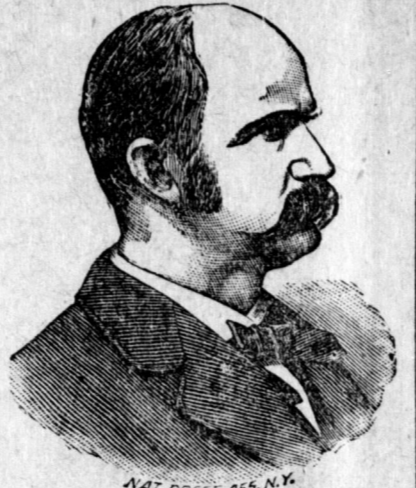
David Bennett Hill.

Anxiously Awaited the appearance of the distinguished New Yorker. He was accorded a splendid reception, the entire audience rising and cheering wildly with the single exception of the little group of Tammany leaders, who sat silent throughout the cheers for their New