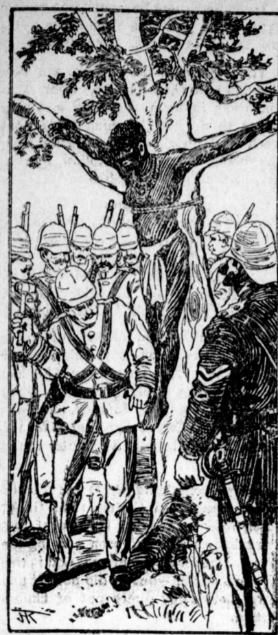
KONGO WOMAN CRUCIFIED BY BELGIAN SOLDIERS.

The director's orders were carried out. Troops of Belgians descended