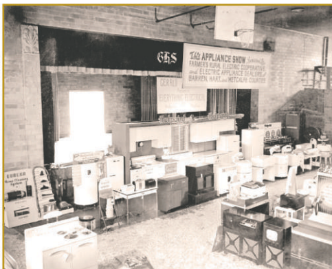
Sponsored by Farmers Rural Electric Cooperative and the electric appliance dealers of Barren, Hart and Metcalfe counties, the Appliance Show featured to latest appliances available on the market. The show was held at Glasgow High School.