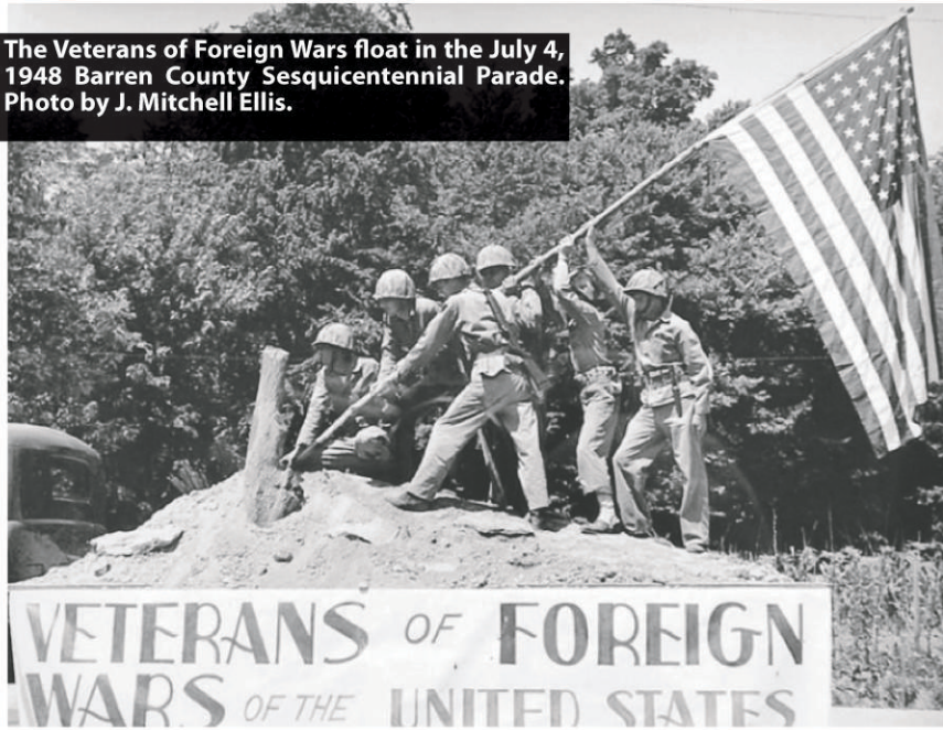
The Veterans of Foreign Wars float in the July 4, 1948 Barren County Sesquicentennial Parade.