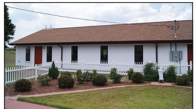
St. Stephen's Episcopal Church St. Stephen's dedicated new building