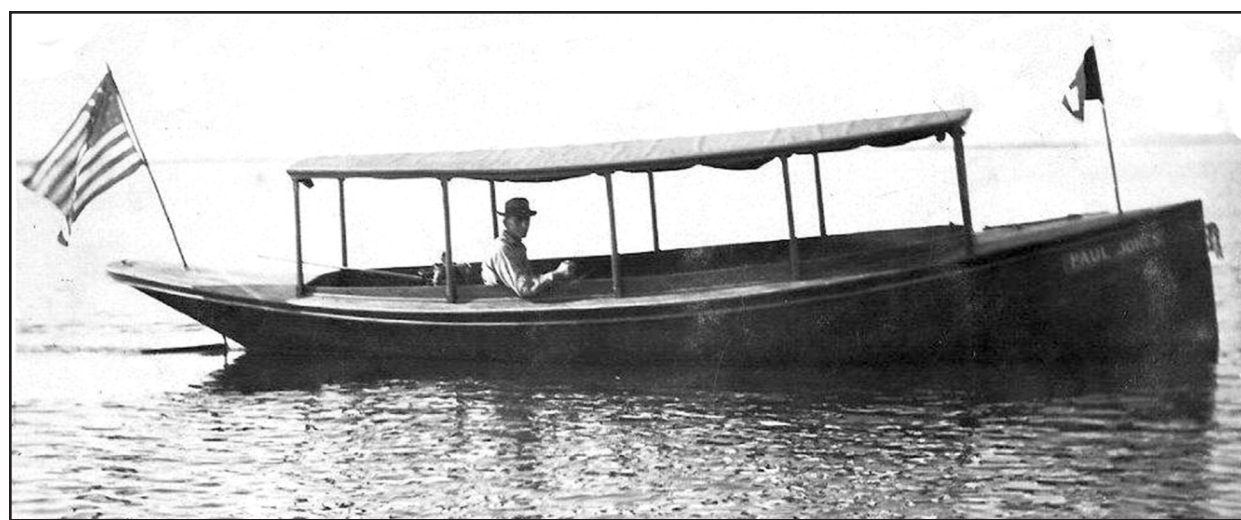
An unidentified man rides a boat in Neville during the early 1900s.