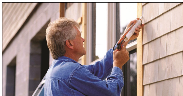
Air leaks can be found where the window meets the wall, this is where you want to add caulking.

home is heated, the air inside that home is pressurized, driving that air through ceiling penetrations and into the attic. This creates leaks that allow warmth to escape the house while inviting colder air in. Plug any air leaks into the attic, which should eliminate drafts as well as condensation.