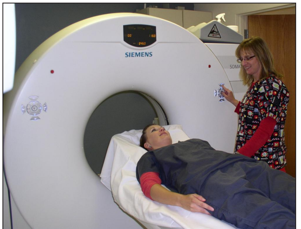
HISTORY – radiology beginning, then, and now: The radiology department has had many changes, because the technological innovation in the field of imaging is constant. Shown is the radiology department in 1950, in the 80s, and in 2014.