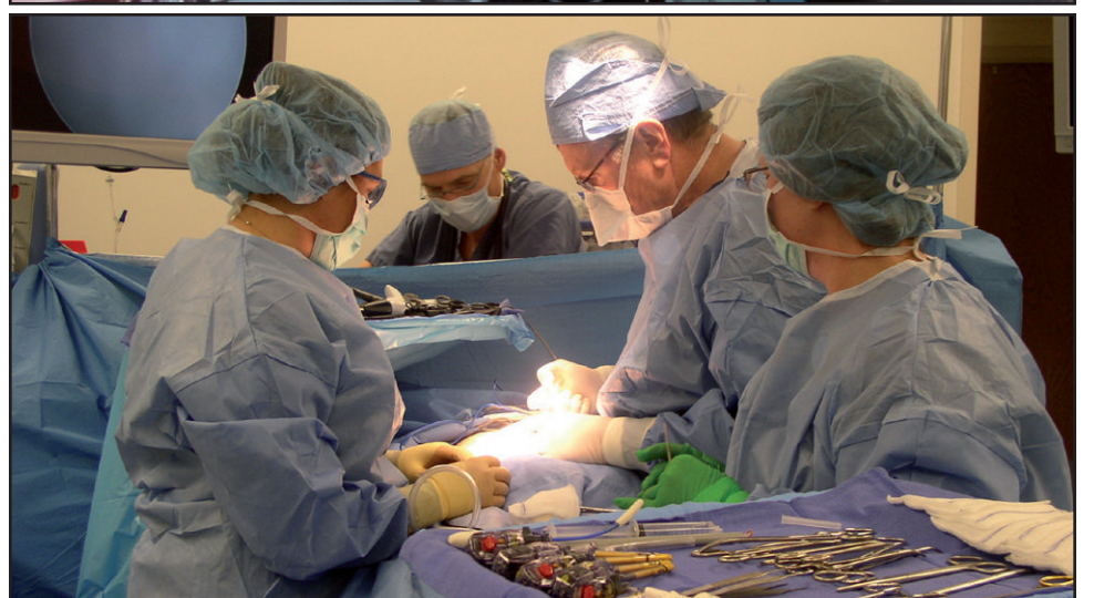
HISTORY – surgery beginning, surgery then, and surgery now: Pictured is the surgery department at the hospital, in 1950, in the 80s or 90s, and in 2014. Much has changed, but one thing has remained constant: the personalized care provided.

Thank You for Keeping Our Community Healthy & Strong