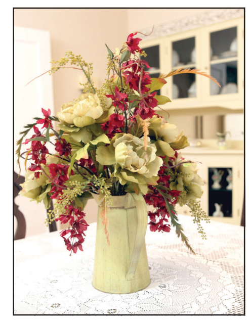
Dining room center piece at American Bungalow B&B.

date up to seven guests. For $150 per night, six guests can lodge at American Bungalow; each additional quest is $25 more. A Continental breakfast and Wi-Fi are provided. 24-hour advance notice is required for reservations, which can be made by calling 325-938-5362 or 832-515-7467 or emailing americanbungalowb&b@centex.net.