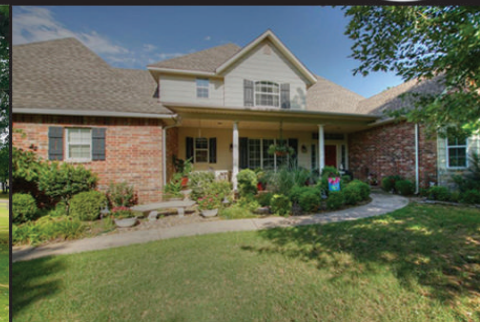
1850 S. Henney Road, Choctaw, 5 bed, 3 bath, 3270 SF MOL $415,000