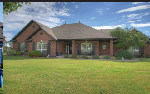
499 Hickory Hill Dr., Choctaw, 3bed, 2 bath, 1905 SF MOL $250,000

1152 S Douglas Blvd. Midwest City, OK 73130 www.nikiihubbs.com nikii@cobblestonerealty.net