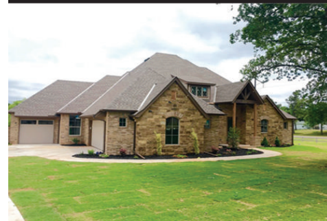
1552 Pine Meadows, Choctaw, 3 bed, 2.5 bath, 2211 SF MOL $309,900