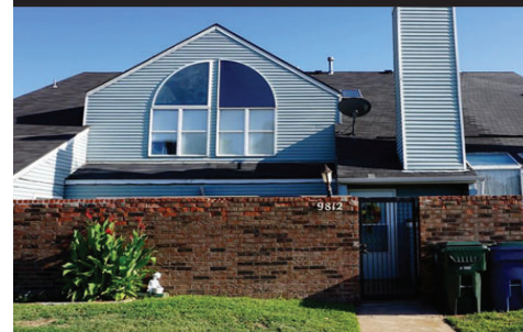
9812 Walnut Lane, Midwest City, 2 bed, 2 bath, 1082 SF MOL $85,000