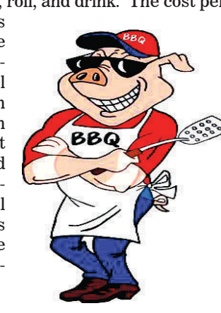
plate is $9.00. Sandwiches and plates will be available for carry-out at lunch beginning at 11:30am. Mt. Bethel United Methodist Church is located on Hwy 127N in Bethlehem. Beginning at 4:00pm you may dine in and enjoy good food and fellowship or carryout plates will also be available. Proceeds from this fundraiser are used for community outreach projects.*

Annual Fall Barbeque Saturday, October 1, 2016, from 4:00pm - until. Barbeque pork or chicken will be served with baked beans, cole slaw, roll, and drink. The cost per