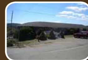
248 Doctor Street Reception area, front office, full BA, file room, storage rm, 6 exam rooms w/ laboratories, 3 offices w/private ent., full BA & kitchen. Basement offices w/reception area, kitchen & 1/2 Bath. $259,000