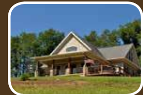
426 Rock House Lane 2 BR, 2 BA, Custom built w/Lake view, Fireplace, Garage, 4 Acres. $349,000