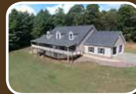
313 Almost Home 3 BR, 2 & 1/2 Bath, Fireplace, View, Oversized two-car garage, 10+ Acres $339,000