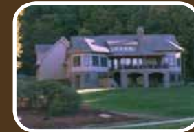
554 Bear Creek Lane 3 BR, 3 Full & 1 & 1/2 BA, Custom Built, Arts & Crafts Style, fenced pasture, stocked pond. 6.41 Acres. $639,900