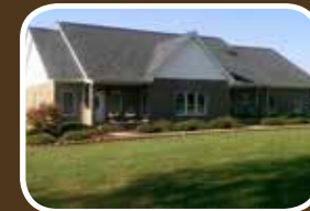
151 Highland Hills Fantastic custom built home on 5.5 acres w/3 car garage, gorgeous kitchen, fireplace. $329,000