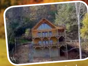
14 Riverfront Road 3 BR, 3 BA, Riverfront, Gated Community, Great Vacation Rental History. $289,000