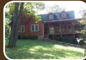
28 Lady Hawk Lane 3 BR, 2 BA, Basement, Fireplace, Furnished, 1+ Acres $ 305,000