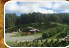
Three Creeks Lane Well established business w/2 homes & 8,000+ marketable Christmas trees on working choose & cut tree farm. Barn w/ fully operating store upstairs, along w/ concession stand & storage areas. Nice pond, fire pits, & playground. $370,000