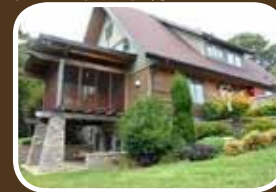
177/185 Effie's Knob Lane 3 BR, 4 BA Garage w/bonus room & bath, 3 BR, 2 BA guest log house, fenced pasture, 12.68 acres $759,000