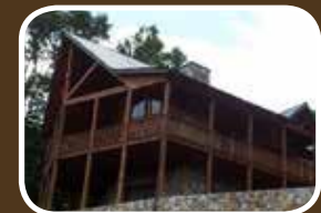
156 Fisher Peak View NEW CONSTRUCTION, 2 BR, 2 BA, Stone Fireplace, View, Waterfront Common Area. $325,000