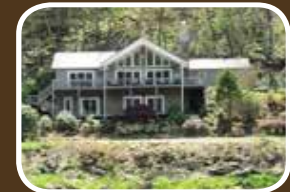
234 Riverwood Lane 4 BR, 2 & 1/2 BA, Located on the Historic New River, Furnished, 1+ Acres / $ 399,000