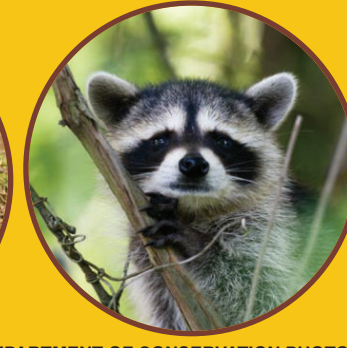
MISSOURI DEPARTMENT OF CONSERVATION PHOTOS