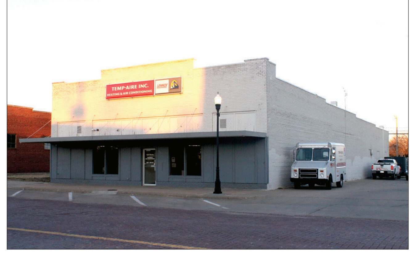
Temp-Aire is located at 214 E. Ave. North in Lyons.

Temp-Aire is expanding our rental services to provide our customers with more hours to rent equipment. We have teamed up with Woydziak Hardware our only Locally owned hardware store to rent out our equipment. Go in and check out all the items that you can rent from Woydiaks. Temp-Aire Rentals will still be your contact for all the equipment displayed on West main street. We hope that these