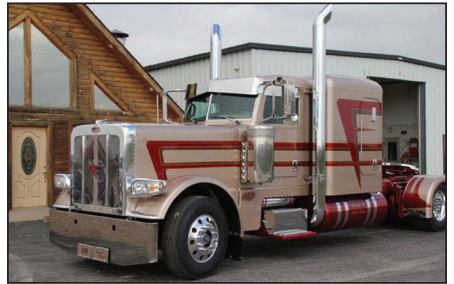
The orange truck (below) won "peoples choice" at the 4 states Chrome Shop Mafia "Guilty by Association" truck show in October. The truck above won "peoples choice" at the Super Rigs Show in May. Both shows were in Joplin Mo. and both trucks are owned by Farmers Oil Co.