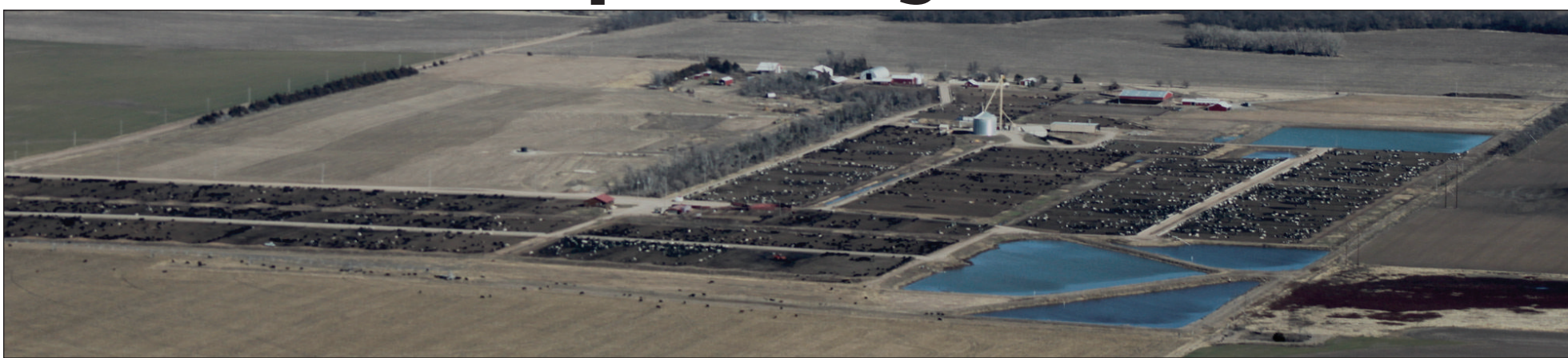
Sellers Feedlot is located a couple of miles southwest of Lyons.

For six generations, Sellers Feedlot of rural Lyons has had a handson approach to their feedlot operations.