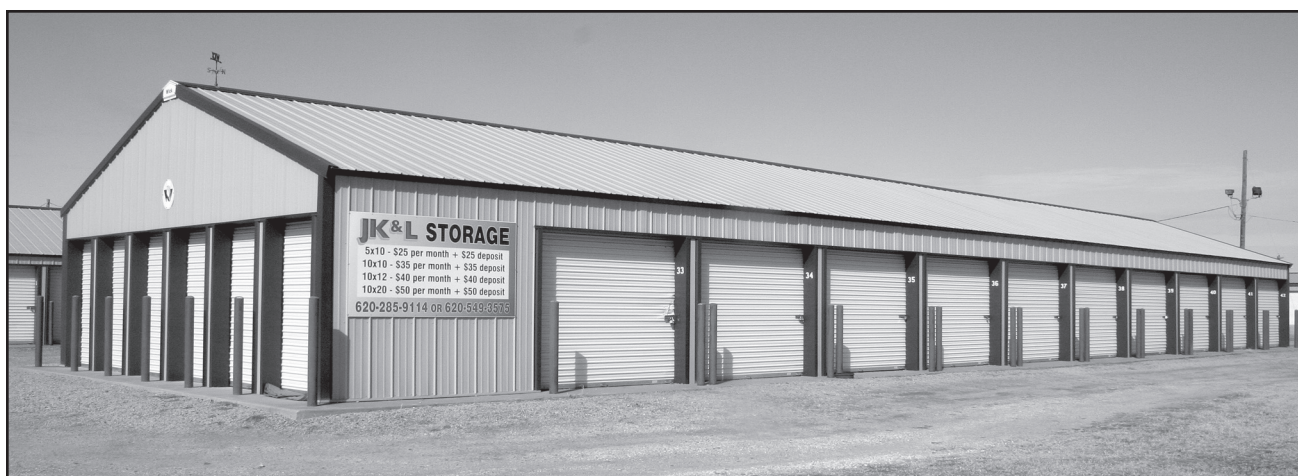
Located on East Highway 156 in Larned, JK&L Storage is perfect for all your storage needs.