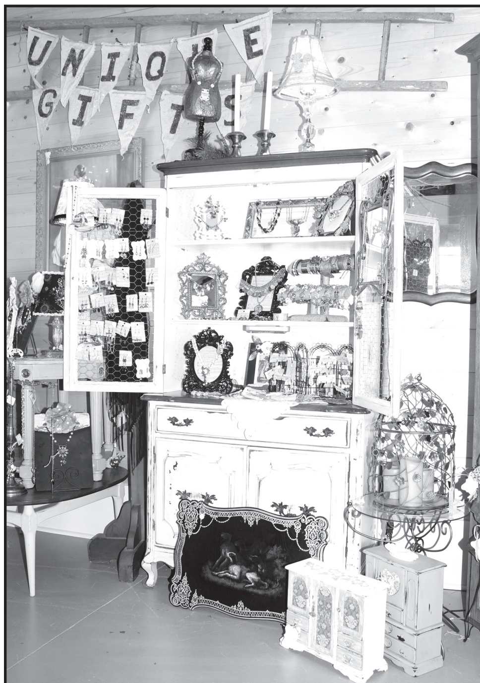
Gifts, decor and more - put new life into your home, family heirlooms, and unique jewelry. Come see all the possibilities at Colglazier Mercantile.

The PRAIRIE VISTA DUPLEX apartment project was a new venture for the city of Larned in 2015. With the support and participation of the people of Larned, the city staff and all the new residents at PRAIRIE VISTA, I am please to say it has been a very successful first year. PRAIRIE VISTA continues to attract residents to live, work and play in the Larned city area which in turn helps to support local businesses, city services and the state facilities located in our backyard. We would like to take this opportunity to thank all of our residents at PRAIRIE VISTA and look forward to the future success of Larned's newest residential community.