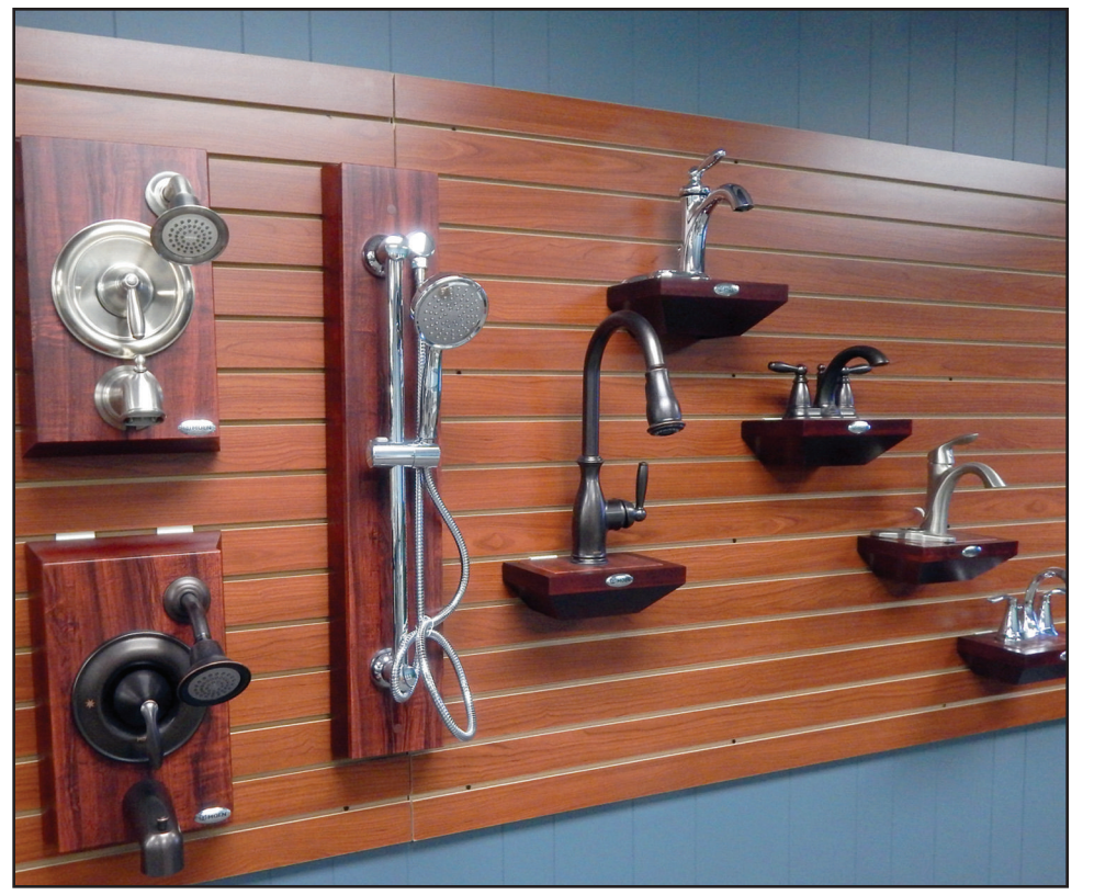
These faucets are on display at the Comfort Pro Inc. facility, 503 Williams, in Great Bend. The company does heating, cooling and plumbing in residential and commercial buildings.