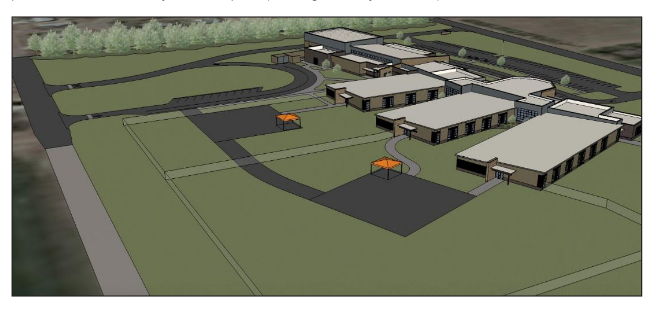
VIEW FROM ABOVE -- This aerial view, looking southwest, features the building's classroom wings as well as the layout for busing and parking access, with playground spaces. The outline of the media center and the gymnasium are visible in the background.