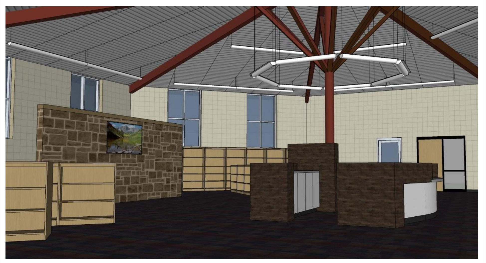
INTERIOR ELEVATION, MEDIA CENTER -- The elementary school's media center immediately evokes the historic presence of the blockhouse at Fort Larned Historic Site, from its hexagonal shape to the post-and-beam ceiling.