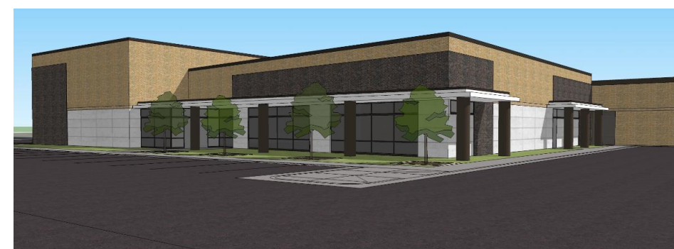
FITNESS, INSIDE AND OUT -- The new weight room/fitness center at Larned High School, showing both interior and exterior elevations.