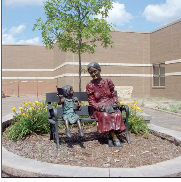
PRECIOUS MOMENTS GRANDMOTHER AND CHILD - one of the features of the Healing Garden. Donations are still being accepted at Pawnee Valley Community Hospital Foundation for future additions.