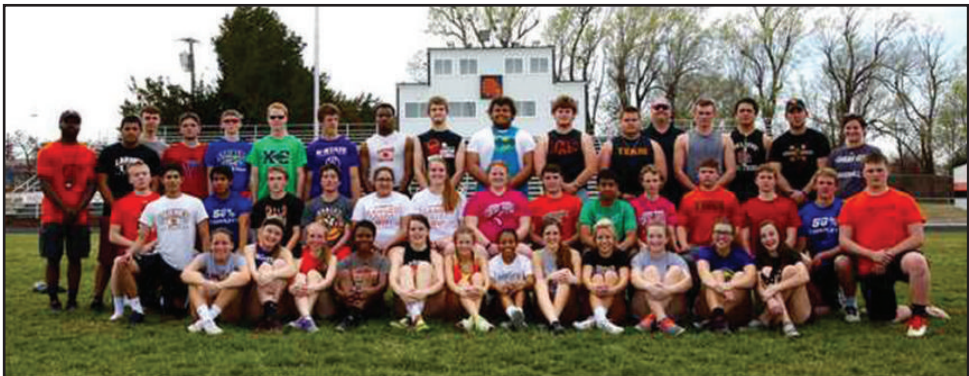
2016 Larned Indian track team