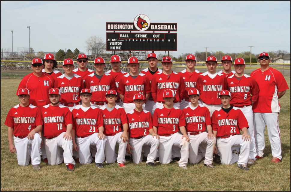
2016 Hoisington Cardinal baseball team