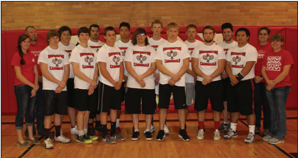
2016 Hoisington Cardinal tennis team