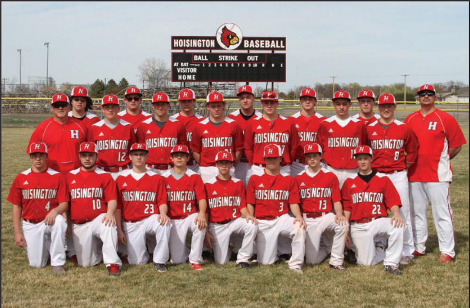
2016 Hoisington Cardinal baseball team