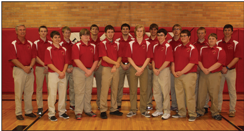
2016 Hoisington Cardinal golf team