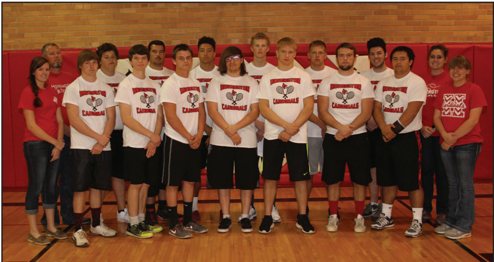
2016 Hoisington Cardinal tennis team