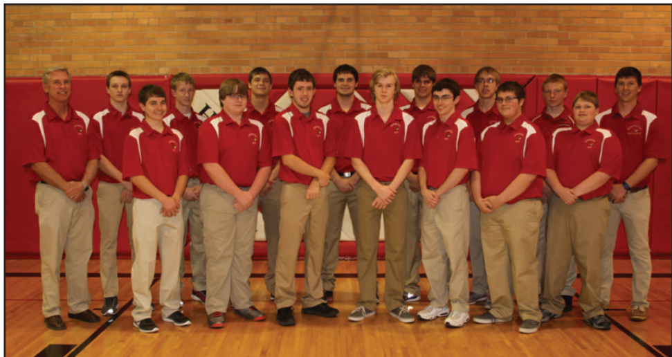
2016 Hoisington Cardinal golf team