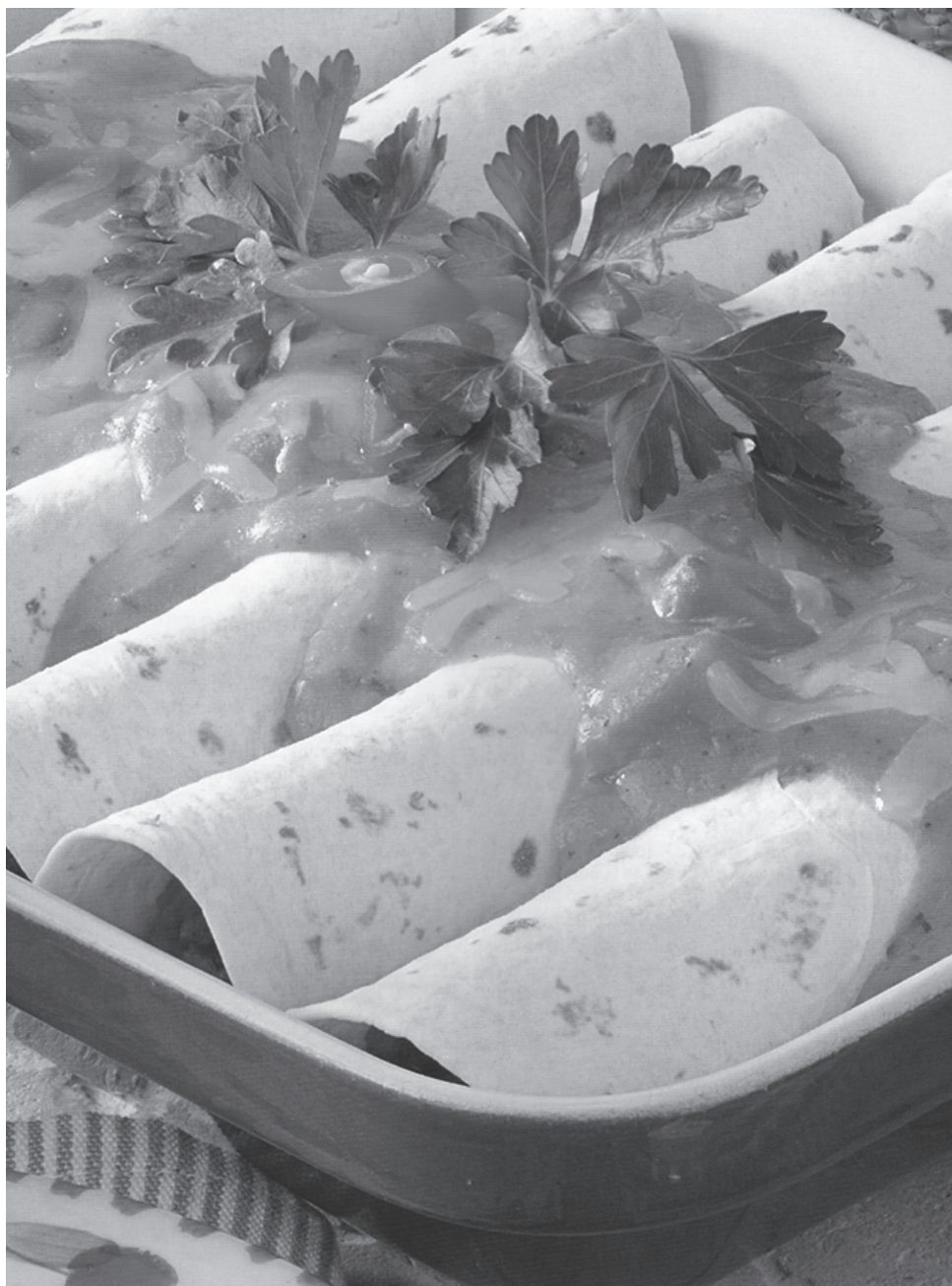
Cheddar Beef Enchiladas are a meal that can be prepared and enjoyed by the entire family. Featuring familiar ingredients presented in a new way, they can satisfy even the pickiest of eaters.

To use frozen casserole: Thaw in the refrigerator overnight. Cover and bake at 350 for 30 minutes. Uncover; bake 5 to 10 minutes longer, or until heated through and cheese is melted.