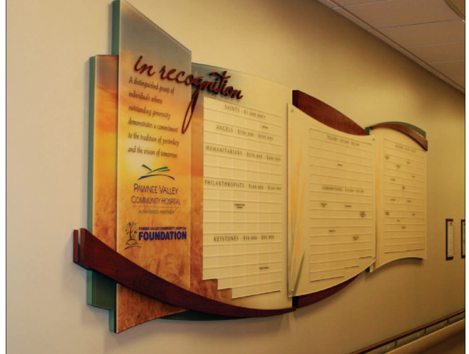
PVCH Foundation's Donor Wall

The Foundation's Healthcare Stars program allows patients to honor associates for providing exceptional care during their stay at PVCH. A permanent recognition piece is displayed across from the Donor Wall.