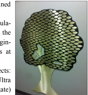
Leaves of Life Legacy Tree

One of Foundation's outreach endeavors is "Ask the Expert", held on the 2<sup>nd</sup> Monday of each month at 9:30 a.m. in the St. Joseph Meeting Room at PVCH. This is an opportunity for healthcare professionals to discuss important health related topics in their field of expertise and answer questions from the audience. Recent topics have included, PVCH's Patient Family Advocacy Committee, Avera eCare, Occupational Therapy, Sleep Apnea awareness, and Seasonal allergies.