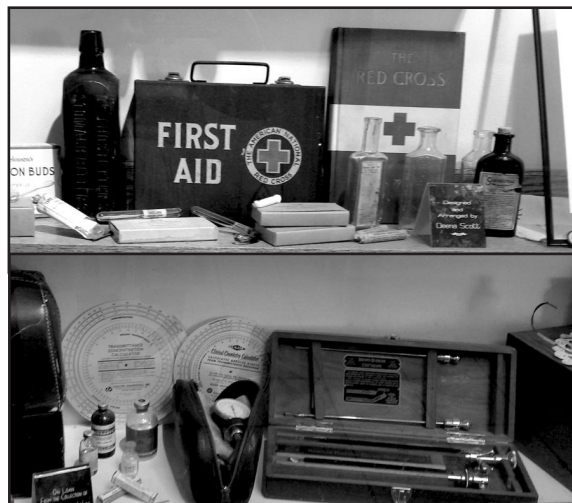
J: Offering a hand up not a hand out

Just fill in the blanks below with your answers of the locations to the matching letter.