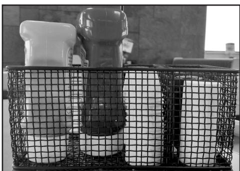
D: Where the elite meet to eat