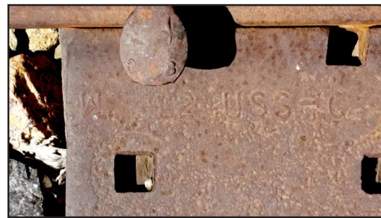
I: The city formed around me