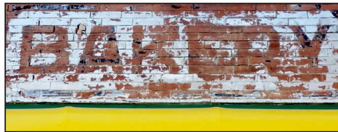
H: Made fresh daily