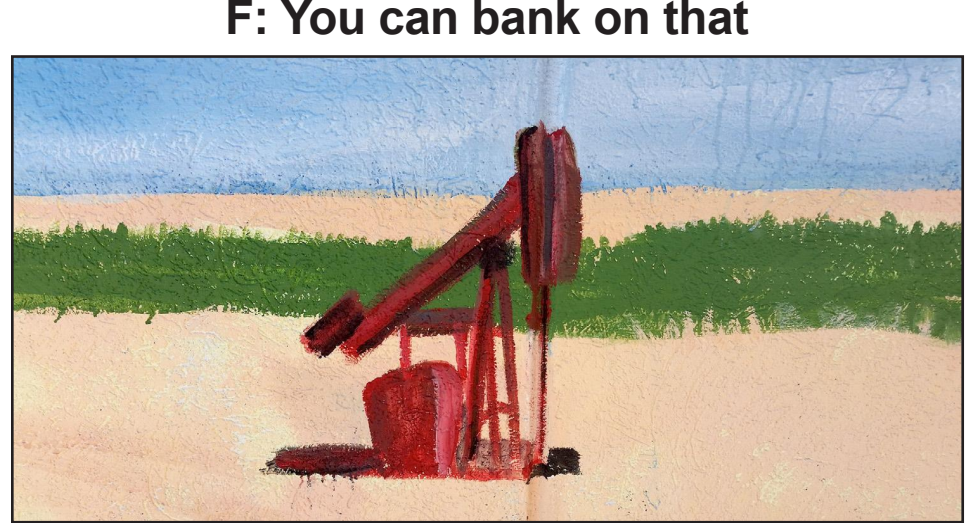
F: You can bank on that