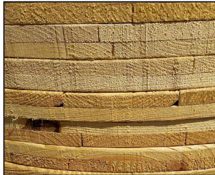
C: Wind me up