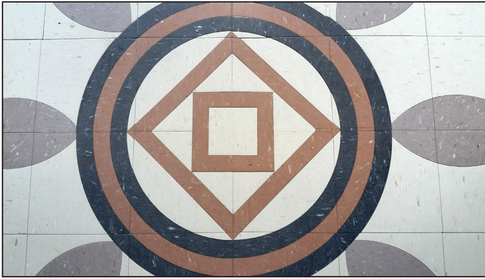
A: Eat in or Carry Out, but no drive-thru