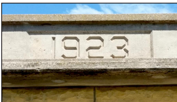
E: Live seating