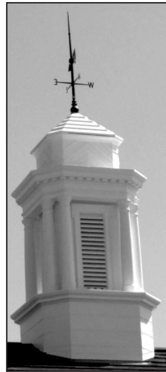
G: Neither snow nor rain nor heat . . .