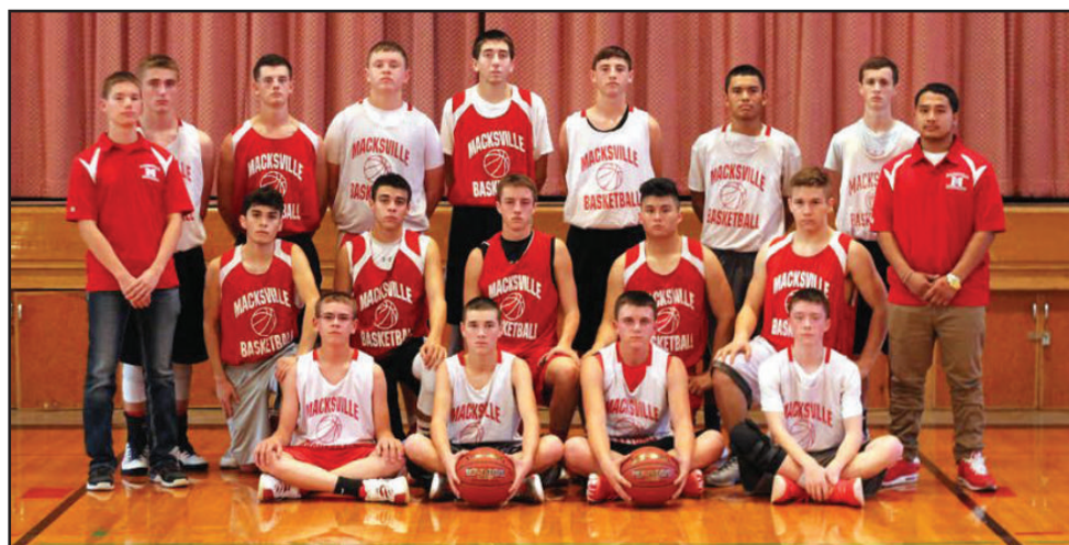
2016-17 Macksville Mustangs