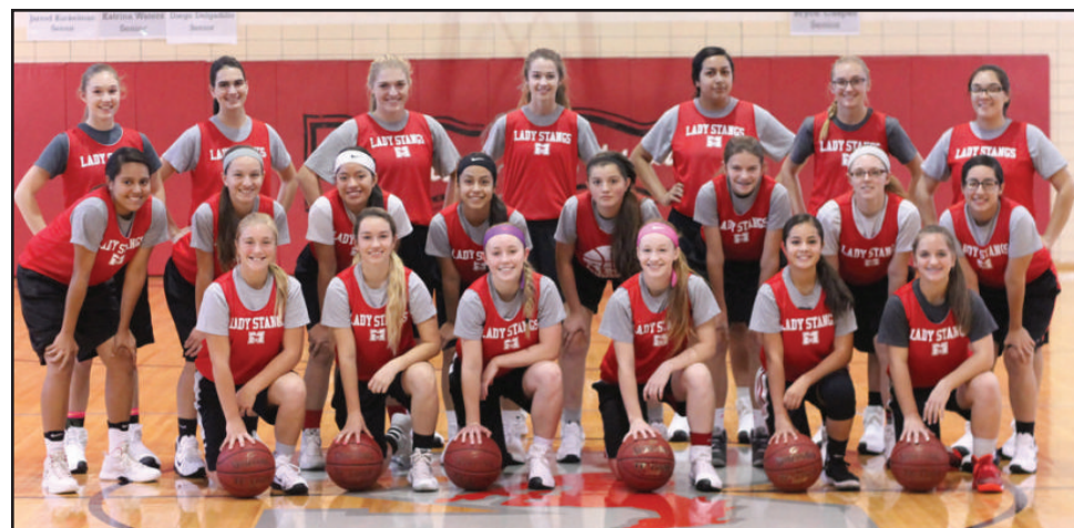
2016-17 Macksville Lady Mustangs