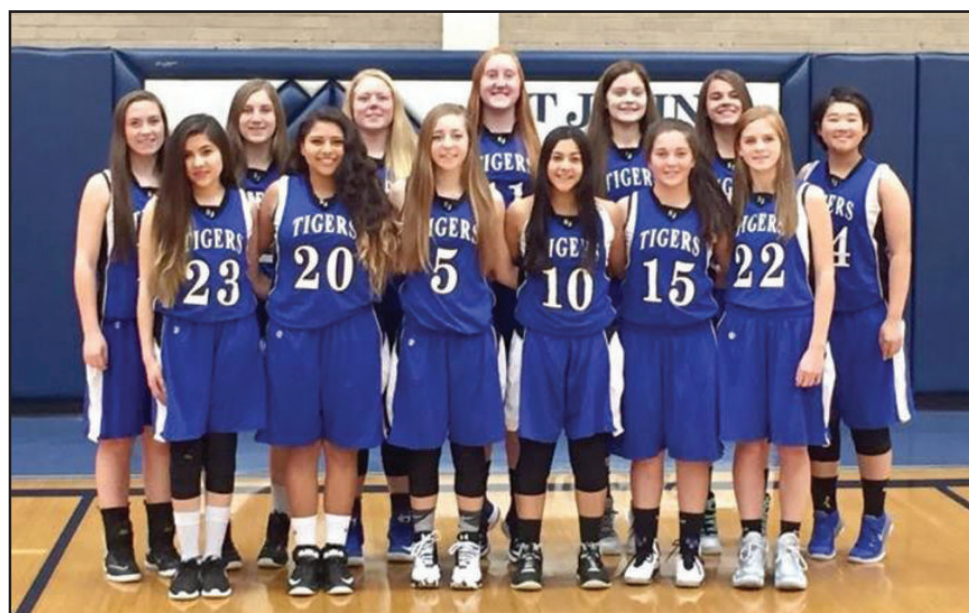
2016-17 St. John Lady Tigers