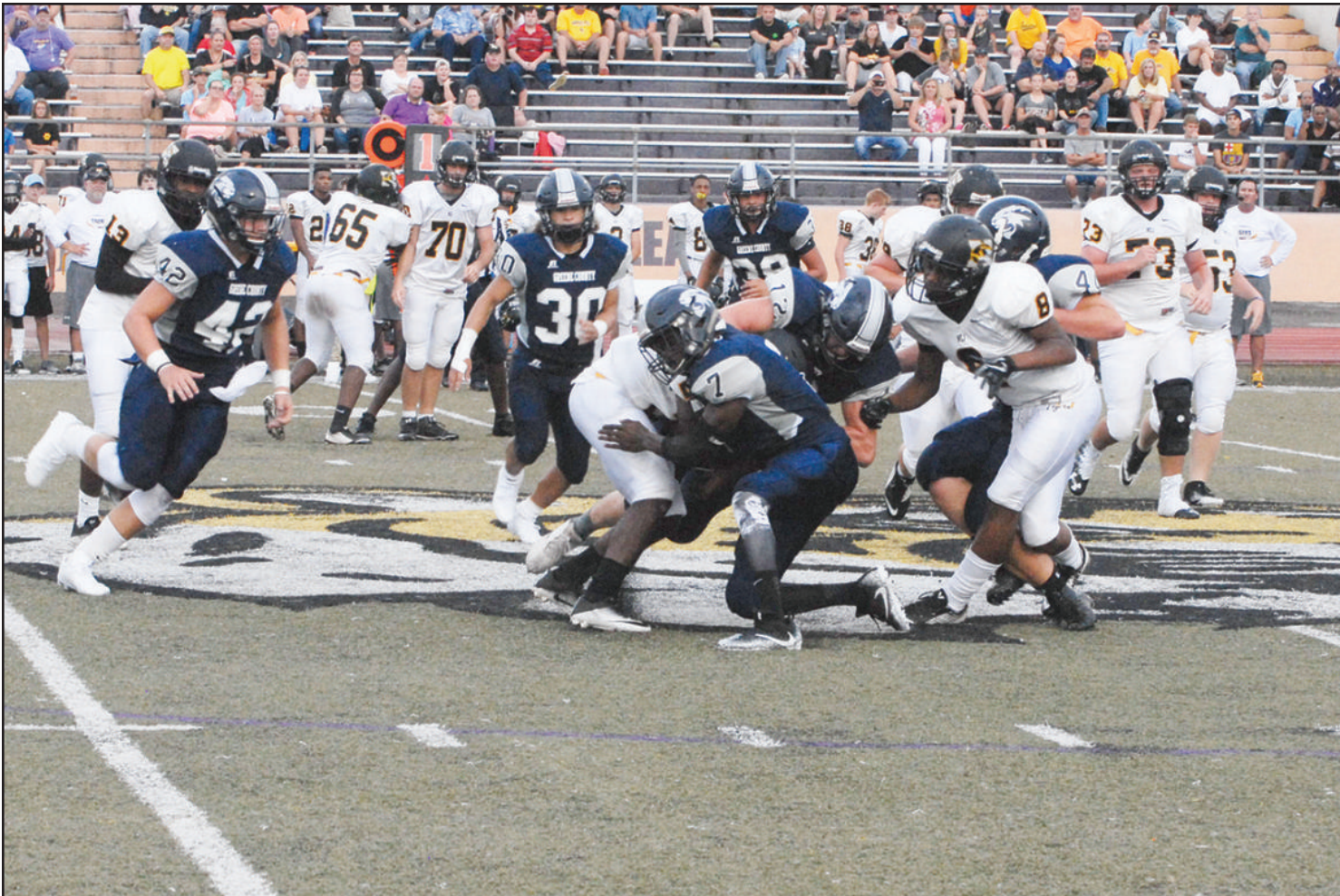
The Wildcat defense has been impressive during the first few weeks of the season, smothering opposing offenses, gang tackling and forcing lots of turnovers. Several defenders are shown here swarming to tackle a Northeast Jones running back in the jamboree at Hattiesburg High School earlier this month.