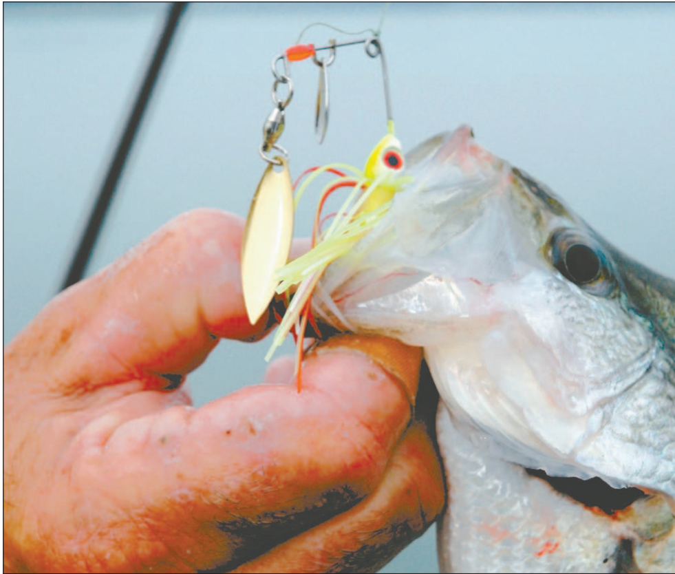
Big crappie often hit small spinnerbaits.