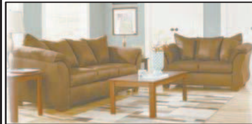
Ashley Sofa and Love Seat $699 Available in six colors