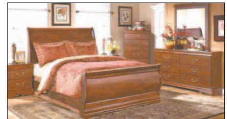
Queen Sleigh Bed, Dresser, Mirror Chest & Night Stand $949