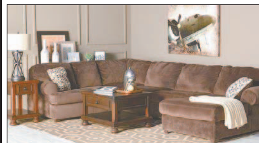
Jessa Place Sectional $999