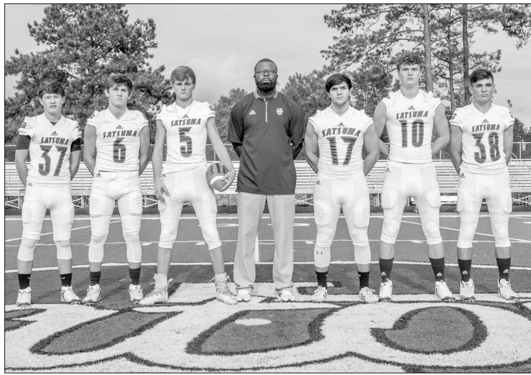
Some of the defensive backs for the Satsuma Gators.