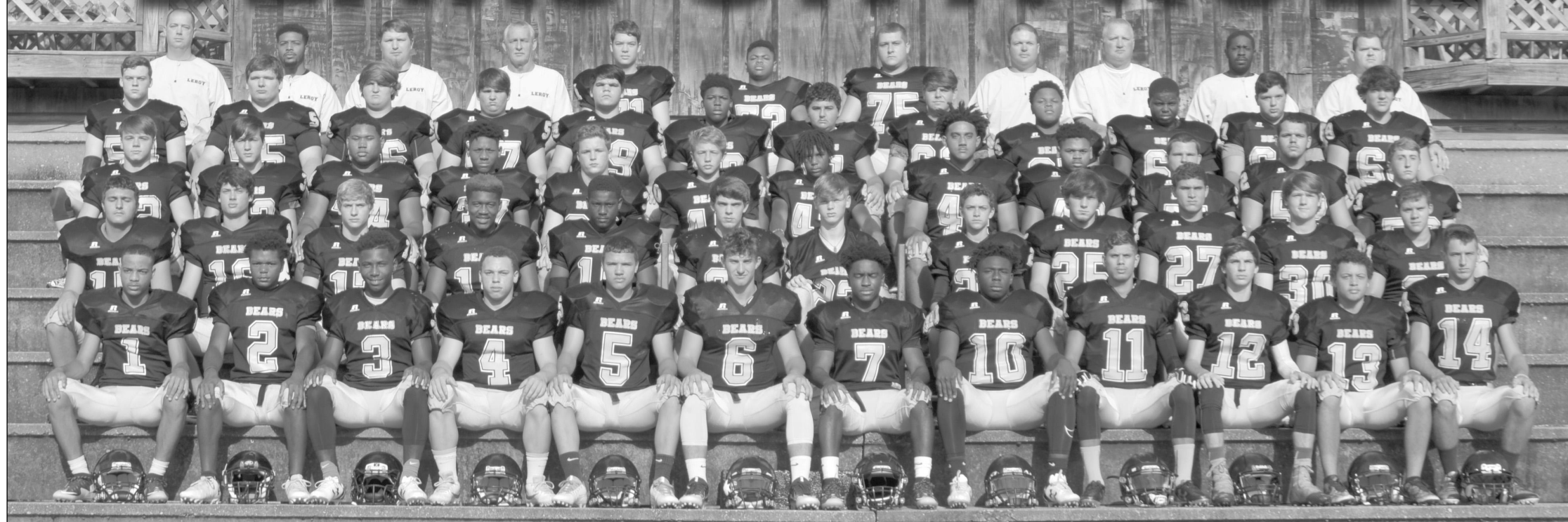
The 2017 Leroy High School Bears.