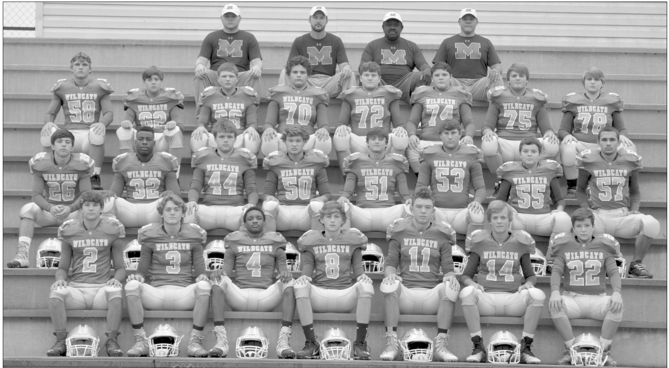
The 2017 Millry High School Wildcats