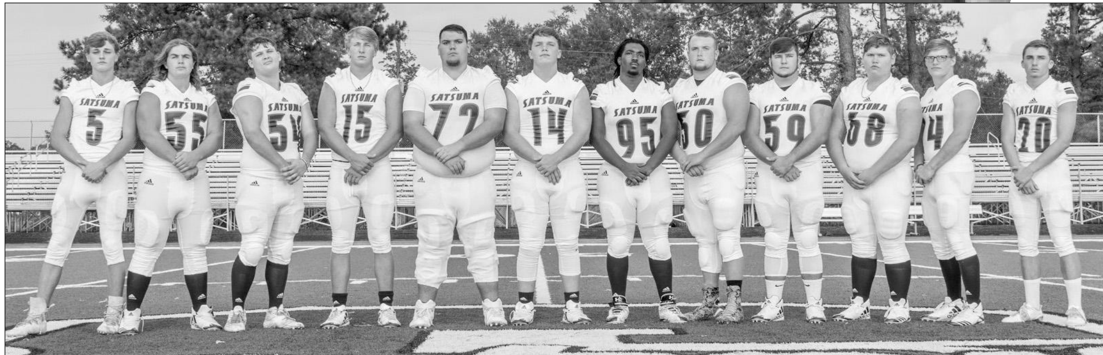
The Satsuma High School seniors.