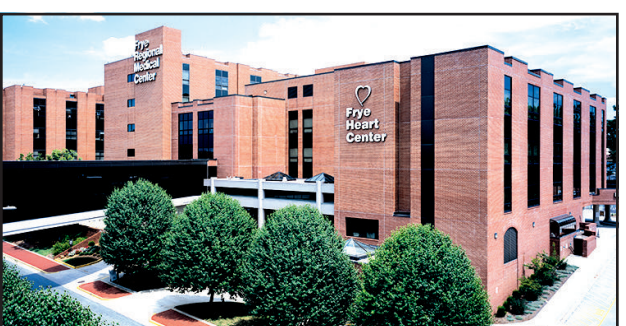
FRYE REGIONAL MEDICAL CENTER

Duke LifePoint Healthcare announced January 4 that it had acquired Frye Regional Medical Center, a 355-bed hospital in