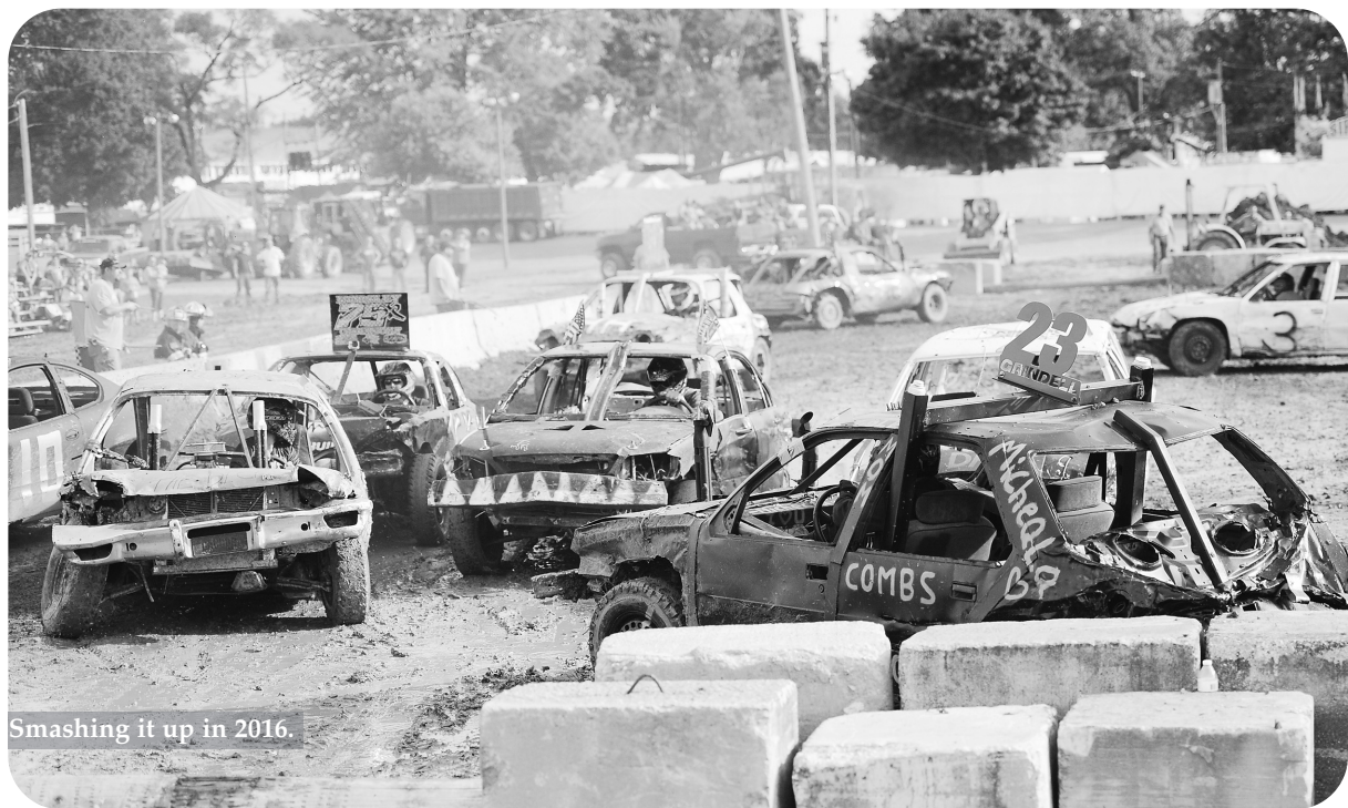
Smashing it up in 2016.

The Upper Sandusky Area Chamber of Commerce will hold a Wyandot County business showcase Friday, Sept. 15, from noon-3 p.m. in the Masters Building.